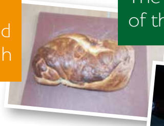
The end result of the bread